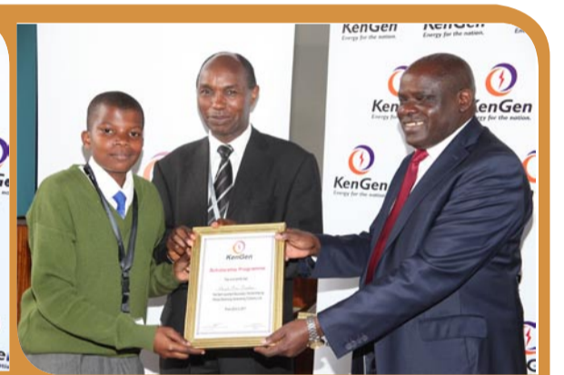
Scholarship Awards 2014.

established in 2012, has taken up education as one of its key pillars. Apart from introducing the Annual Mentorship sessions and streamlining the administration of the scholarship programme, the foundation is working towards expanding the numbers of scholarships through partnerships and staff participation.