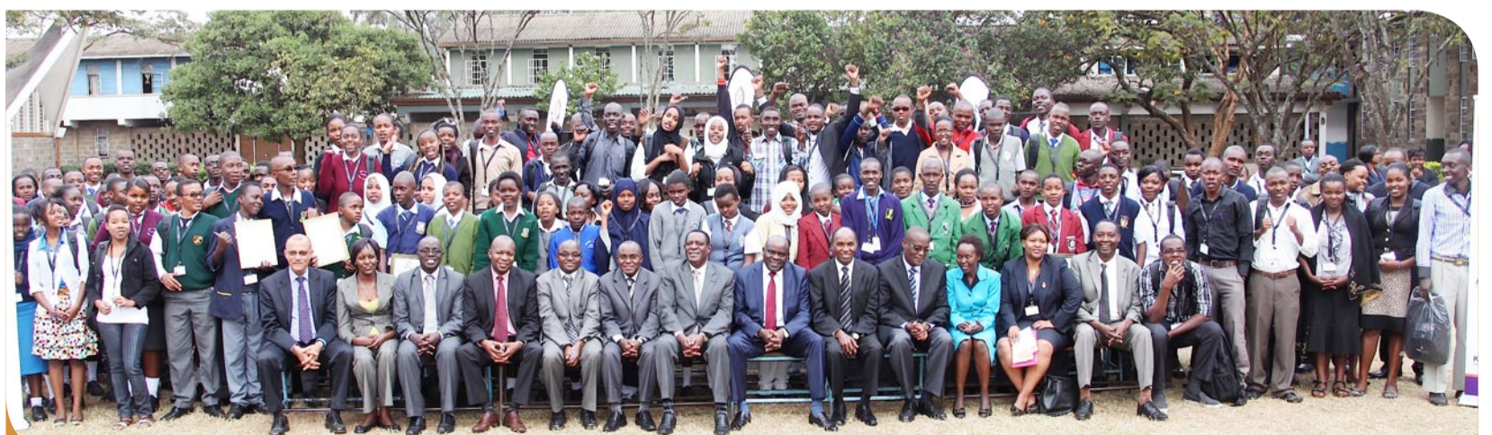
KenGen and KenGen Foundation Officials with students attending the 2014 Mentorship Program and Scholarship Awards ceremony.

“The programme started in 2005 when KenGen awarded scholarships to 14 high school students from across the country. A year later, a similar number of university students entered the programme.”